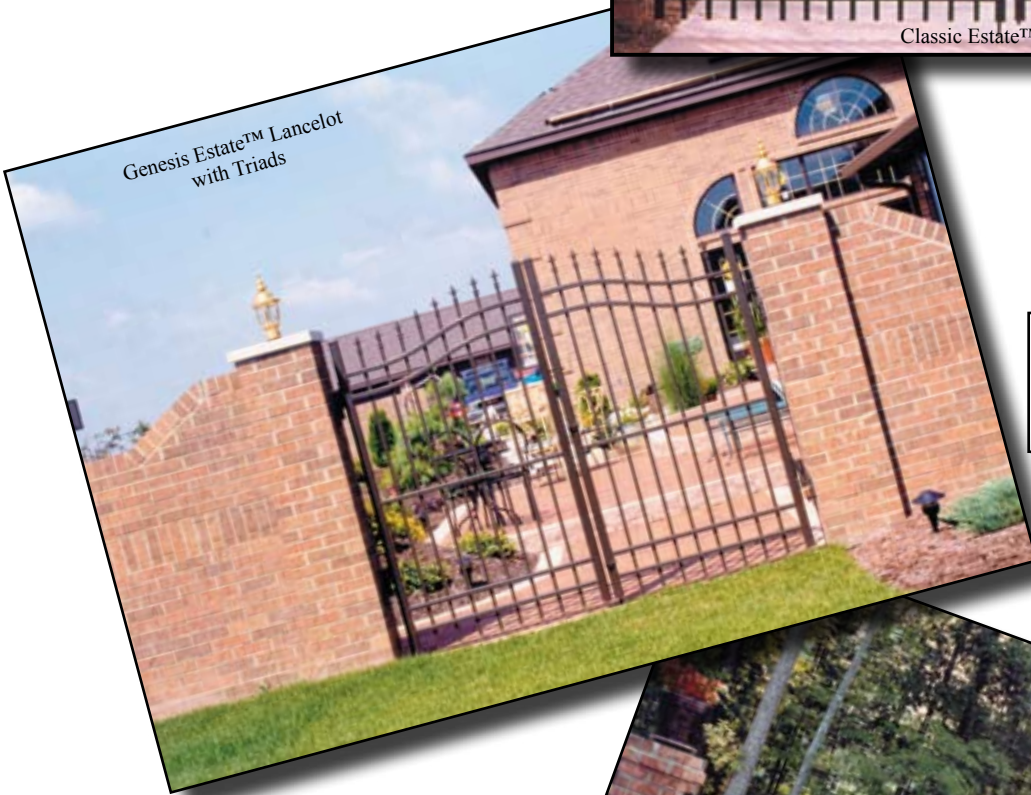
Genesis Estate™ Lancelot with Triads

A statement in itself. Adding value and aesthetics to complete the look of elegance.