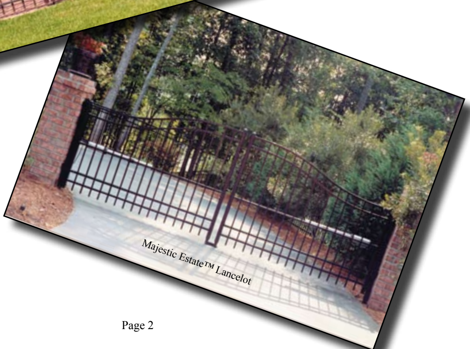
Majestic Estate™ Lancelot

Make an impression with this Majestic Estate™ Entry Gate.