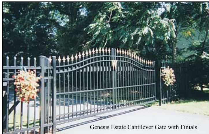
Genesis Estate Cantilever Gate with Finials

The Estate™ design on the TransPort™ top track combines the look of elegance with the functionality and space efficiency of the sliding enclosed-track system.