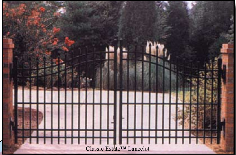
Classic Estate™ Lancelot

Estate™ Gates are not only beautiful but they are strong and maintenance-free. All framework is 1/4" thick and all intersections are welded.